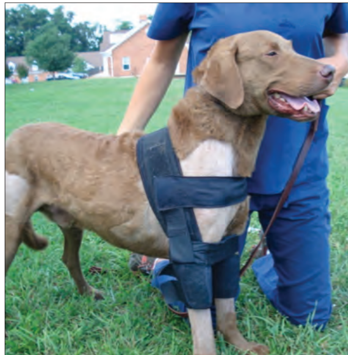
FIGURE 4. DOG WITH CONCURRENT SHOULDER PATHOLOGY PLACED IN HOBBLER AS PART OF THE POST-OP REHAB PROGRAM.

During this phase, rehabilitation therapy focuses on preservation of range of motion, addressing not only the tendinopathy, but any compensatory issues as well. Once the tissues have healed, rehabilitative therapy focuses on muscle strengthening and reconditioning for long-term tissue protection from re-injury.