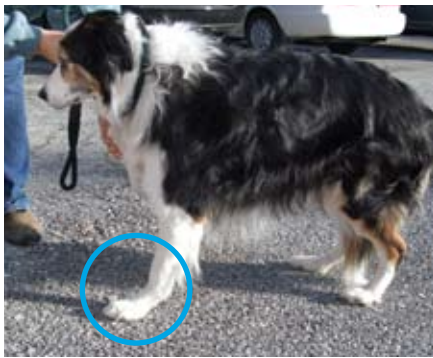
Figure 3. Dog that has sustained a left forelimb carpal hyperextension injury.