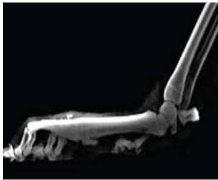
Figure 4. X-ray of a dog with a carpal hyperextension injury.

varus or valgus), which can help determine ligament integrity. Chronic or repetitive injuries may have bone spurs where ligaments attach, and those will also show up in an x-ray.