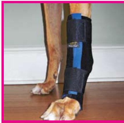
Figure 5. Carpo-flex support wrap for a carpal injury

Treatment is based on the location and severity of the injury. Mild to moderate ligament sprains (Grades 1 and 2) are amenable to external support, using specialized wraps, orthotics, a splint, or a cast for six to eight weeks, in addition to rehabilitation therapy. Supportive bandages allow for joint immobilization, preventing further injury to the affected ligament and providing stability so the ligament can heal. Specialized support wraps and orthotics like those shown in Figure 5 can be custom designed and manufactured for each individual dog. For more severe cases, an external fixator with a hinge can be placed above and below the injured joint. This allows the joint to heal, while at the same allowing controlled range of motion to strengthen the resulting repair. Unsupported or premature weight bearing during healing can result in an elongated ligament, negating the return of ligament strength and resulting in persistent instability. Nonsteroidal anti-inflammatory medications and cryotherapy (ice wraps) can be administered in the initial stages of the injury to improve comfort, reduce swelling, and facilitate overall limb use.